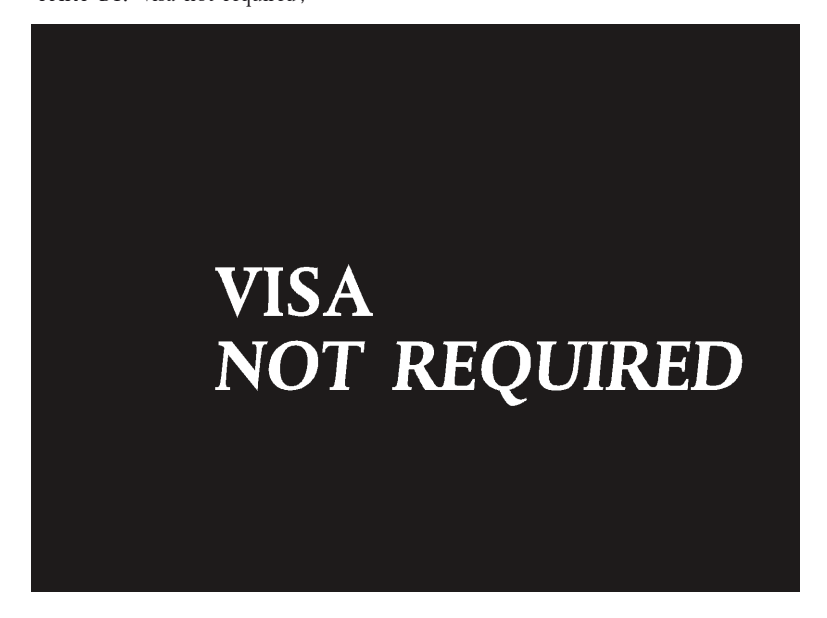
PART B2: 'all passports'.